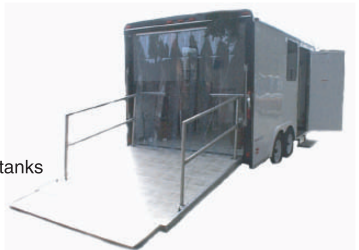
Rear loading ramp