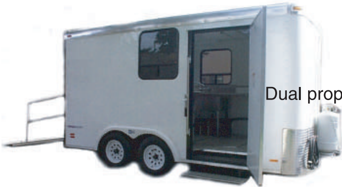
Dual propane tanks