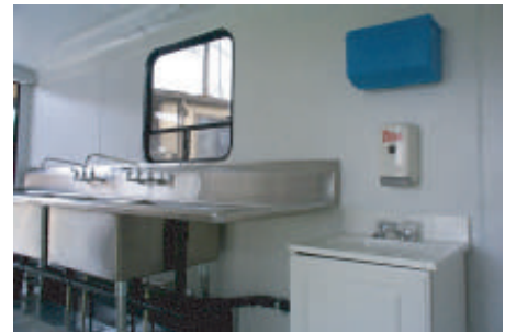
Separate Hand Washing Sink